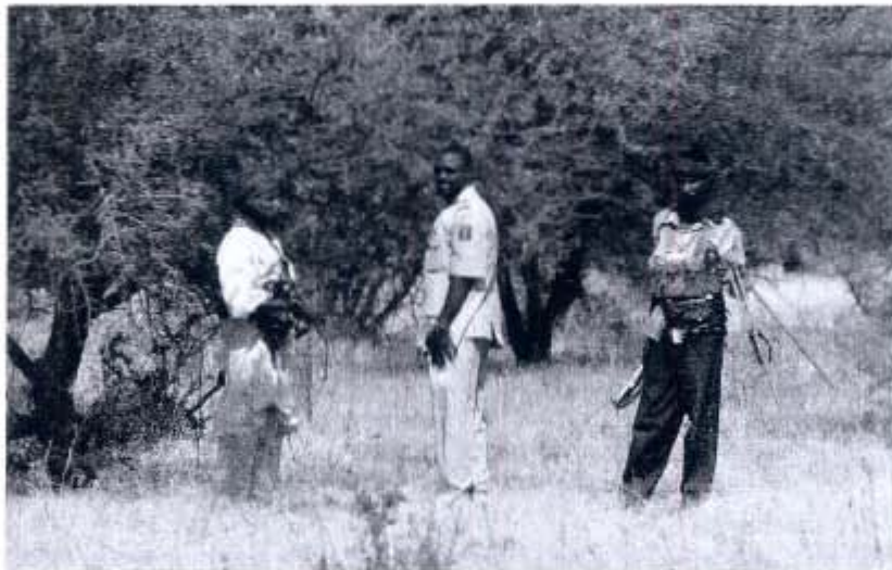
Chadian Mediator with two Janjaweed Militia (4 November 2004)